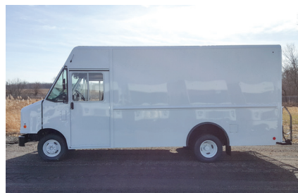
MOTIV-POWERED STEP VAN

Motiv is the only Ford eQVM approved provider of all-electric chassis for commercial trucks and buses and benefits from engineering insights and support from Ford to ensure safety and reliability.