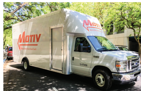
MOTIV-POWERED BOX TRUCK