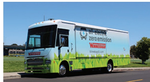
MOTIV-POWERED MOBILE OUTREACH VEHICLE