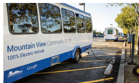
MOTIV-POWERED SHUTTLE BUS