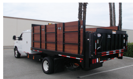
EPIC POWERED WORK TRUCK

Motiv is a Ford eQVM-approved provider of all-electric chassis for commercial trucks and buses and benefits from engineering insights and support from Ford to ensure safety and reliability.