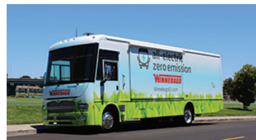
MOTIV-POWERED MOBILE OUTREACH VEHICLE