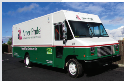
MOTIV-POWERED WALK-IN VAN