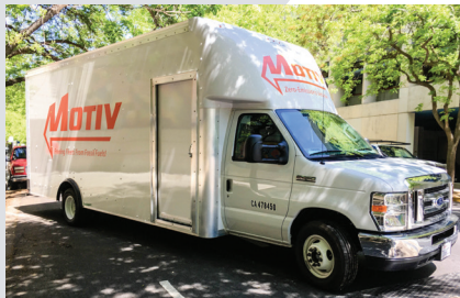
ALL-ELECTRIC BOX TRUCK