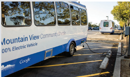
ALL-ELECTRIC SHUTTLE BUS