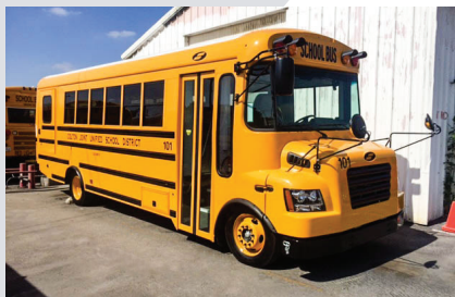
ALL-ELECTRIC TYPE C SCHOOL BUS